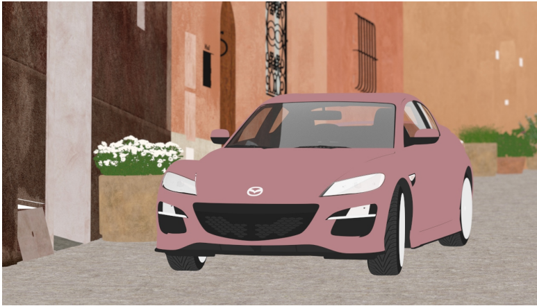
Figure 3.4 – Example albedo image obtained using the first diffuse or glossy (non-delta) hit. Note that the albedos of perfect specular (delta) transparent surfaces are computed as the Fresnel blend of the reflected and transmitted albedos.

The albedo for dielectric surfaces (e.g. glass) should be either 1 or, if the surface is perfect specular (i.e. has a delta BSDF), the Fresnel blend of the reflected and transmitted albedos. The latter usually works better but only if it does not introduce too much noise or the albedo is prefiltered. If noise is an issue, we recommend to split the path into a reflected and a transmitted path at the first hit, and perhaps fall back to an albedo of 1 for subsequent dielectric hits. The reflected albedo in itself can be used for mirror-like surfaces as well.