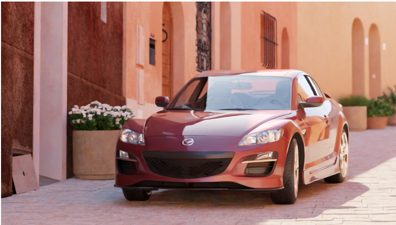
Figure 3.2 – Example output beauty image denoised using prefiltered auxiliary feature images (albedo and normal) too.

For denoising beauty images, it accepts either a low dynamic range (LDR) or high dynamic range (HDR) image (color) as the main input image. In addition to this, it also accepts auxiliary feature images, albedo and normal , which are optional inputs that usually improve the denoising quality significantly, preserving more details.