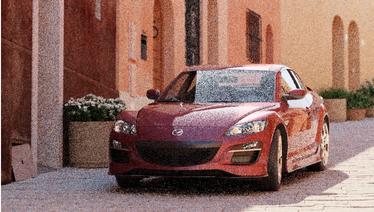
Figure 3.1 – Example noisy beauty image rendered using unidirectional path tracing (4 samples per pixel). Scene by Evermotion.

The RT (ray tracing) filter is a generic ray tracing denoising filter which is suitable for denoising images rendered with Monte Carlo ray tracing methods like unidirectional and bidirectional path tracing. It supports depth of field and motion blur as well, but it is not temporally stable. The filter is based on a convolutional neural network (CNN) and comes with a set of pre-trained models that work well with a wide range of ray tracing based renderers and noise levels.