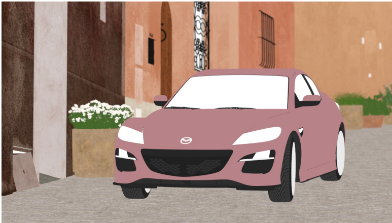
Figure 3.3 – Example albedo image obtained using the first hit. Note that the albedos of all transparent surfaces are 1.

The albedo image is the feature image that usually provides the biggest quality improvement. It should contain the approximate color of the surfaces independent of illumination and viewing angle.